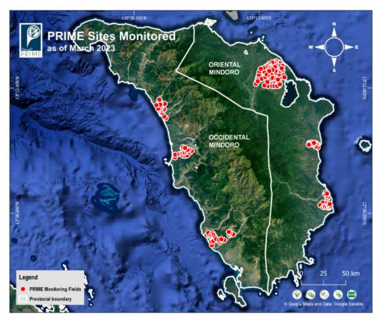
Figure 1. Total PRIME monitoring fields in Region IV-B (MIMAROPA) as of March 2023.