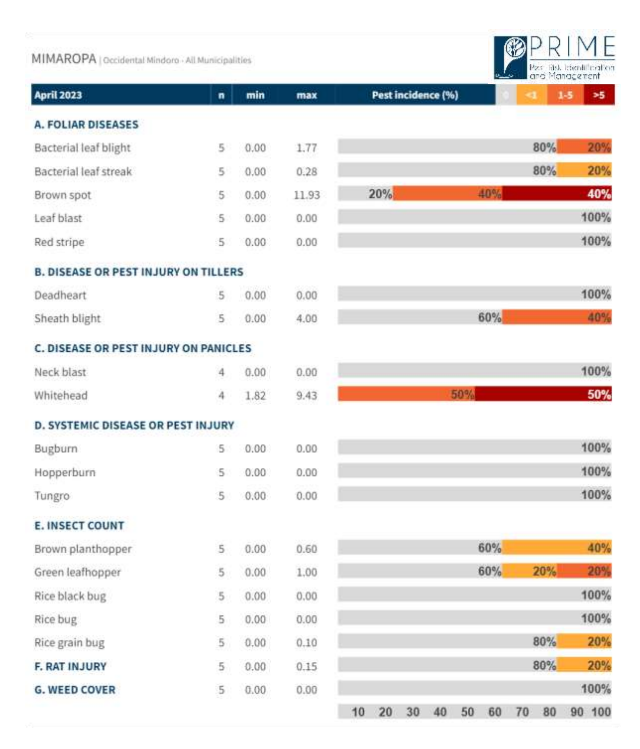
Figure 3. Incidence of pest injuries, counts of insect pests, and weed cover in Occidental Mindoro on April 2023. Horizontal bar shows the proportion of fields in each range of pest injury incidence, insect count or weed cover.