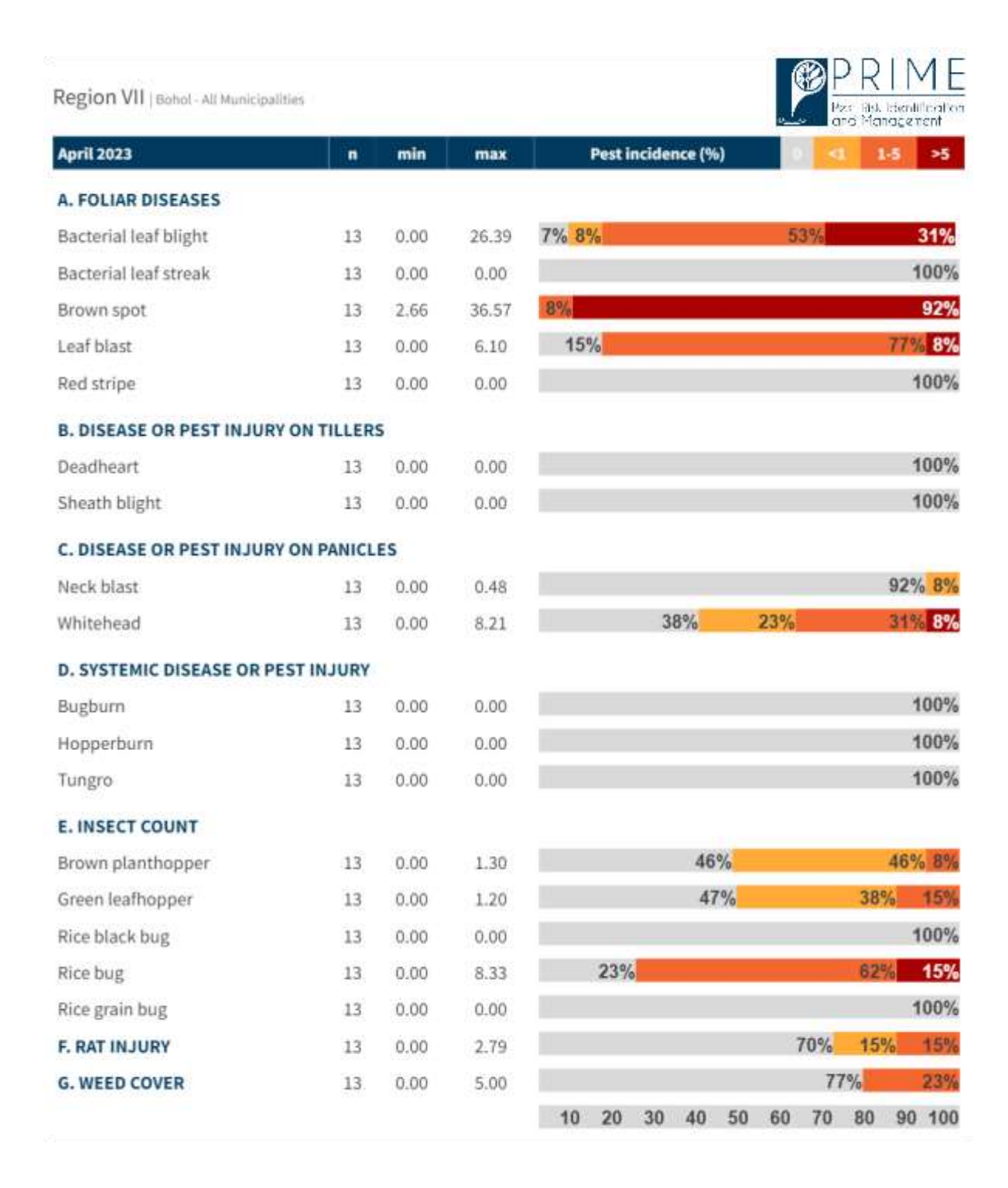
Figure 2. Incidence of pest injuries, counts of insect pests, and weed cover in Bohol on April 2023. Horizontal bar shows the proportion of fields in each range of pest injury incidence, insect count or weed cover.