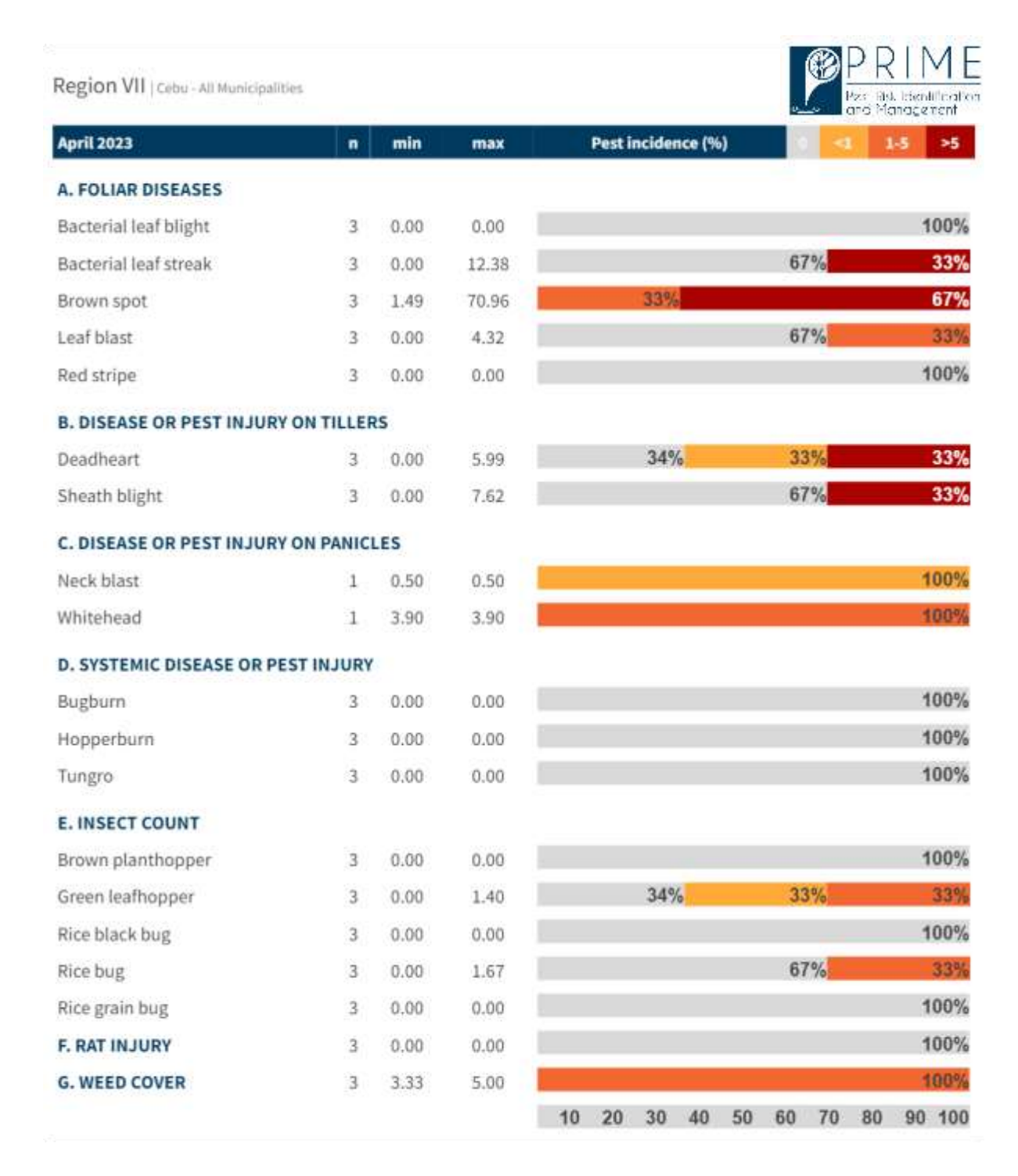
Figure 4. Incidence of pest injuries, counts of insect pests, and weed cover in Cebu on April 2023. Horizontal bar shows the proportion of fields in each range of pest injury incidence, insect count or weed cover.